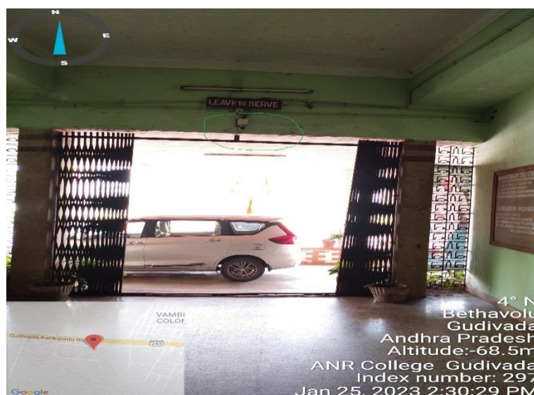
CCTV camera in corridor outside classroom

24-hour CCTV surveillance is maintained in the college. It helps to keep a check on unruly activities. Students and other employees in the college too remain cautious about the surveillance. Discipline is also maintained and it also provides a sense of security to the students and even their guardians. Students wear identity cards at all times to ensure their identity. The institution takes good care of the students in every aspect.